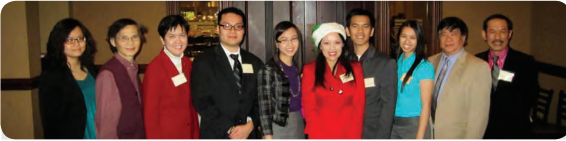
VCSA HOUSTON EXECUTIVE BOARD AND VCSA BOARD MEMBERS

VCSA Houston chapter has made an impact with the local community through the service of its many volunteers. Every year our volunteers file income tax returns free of charge to low-income households. Our volunteers participate in several cultural events and hold performances at local community centers and museums. We partner with local organizations such as the Children's Museum of Houston and Asia Society to provide volunteers at community events. Most recently, our volunteers worked alongside other local organizations in organizing and administering a local Walkathon to raise funds for Typhoon Haiyan victims. The volunteers of VCSA Houston chapter continue to help promote a culture of volunteerism within the community.