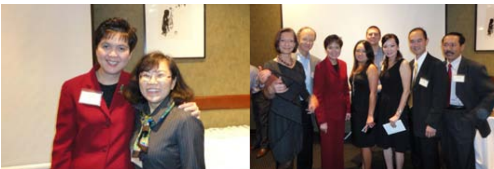
Great appreciation to CenterPoint Energy