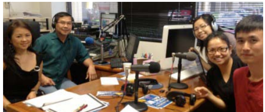
Monthly Radio Talk Show - Con Cháu Tiên Rồng