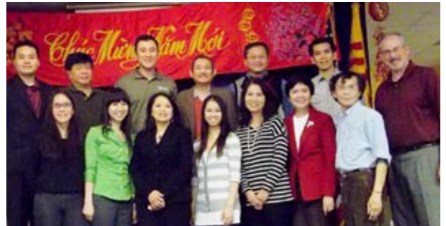
VCSA Board of Directors and Executive Board