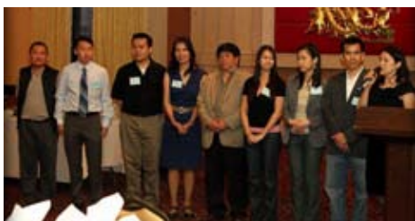
VCSA Executive Board