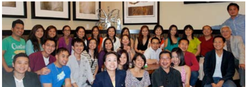
General Meeting with New Members