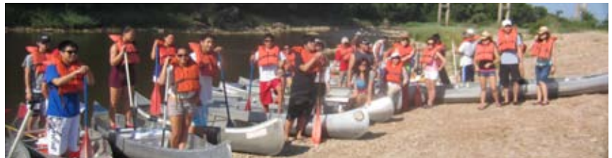
June Canoeing Social