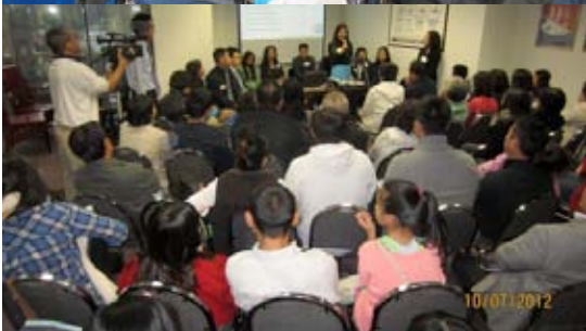
October Career Day