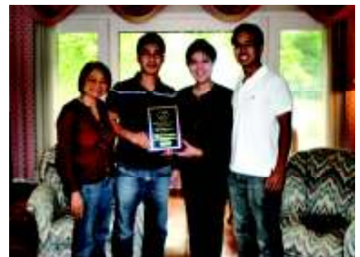
Willows Foundation Leadership Award