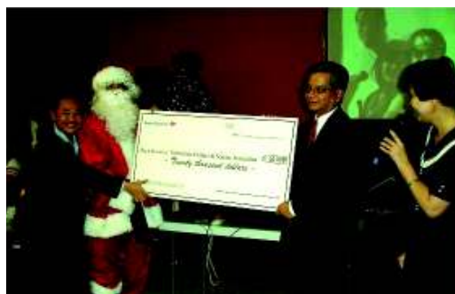
Bank of America Grant Check Presentation