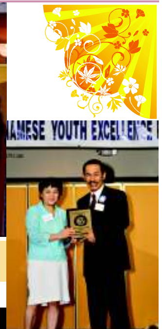
Reliant Energy Sponsorship