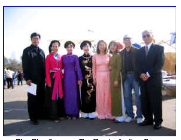
Tha Tho Game at Tet Festival - San Diego