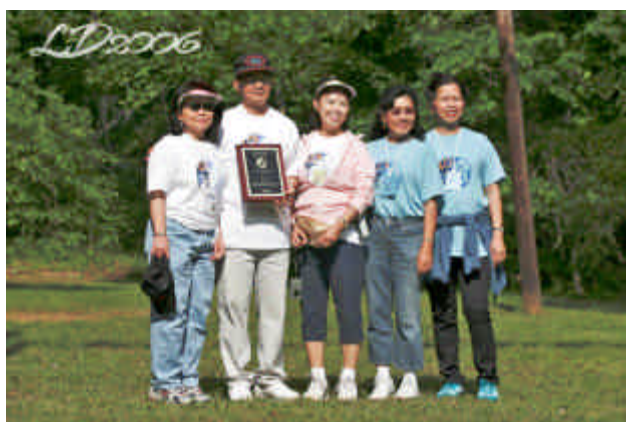
ExxonMobil Volunteers team: