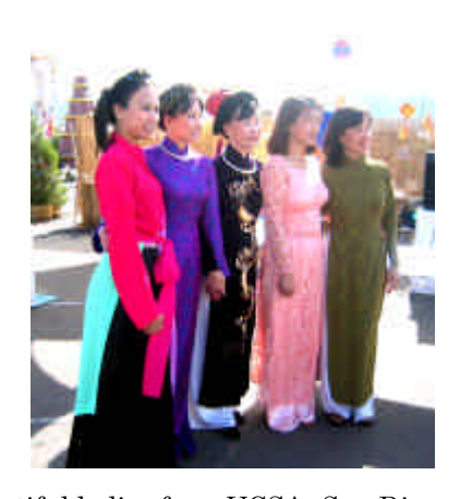
Beautiful ladies from VCSA- San Diego Chapter